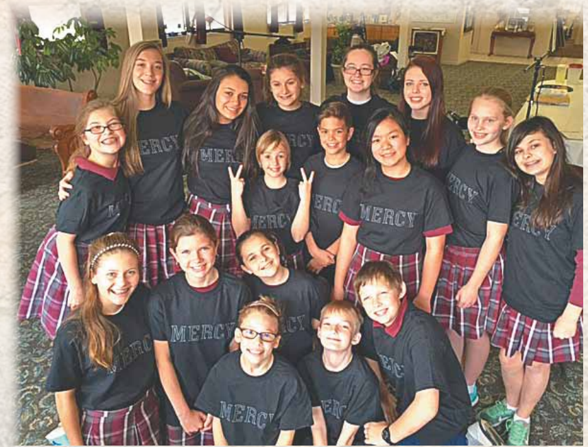
St. John Neumann Catholic School students pose after taking pledge calls at Covenant Catholic Radio/St. Louis Radiothon.