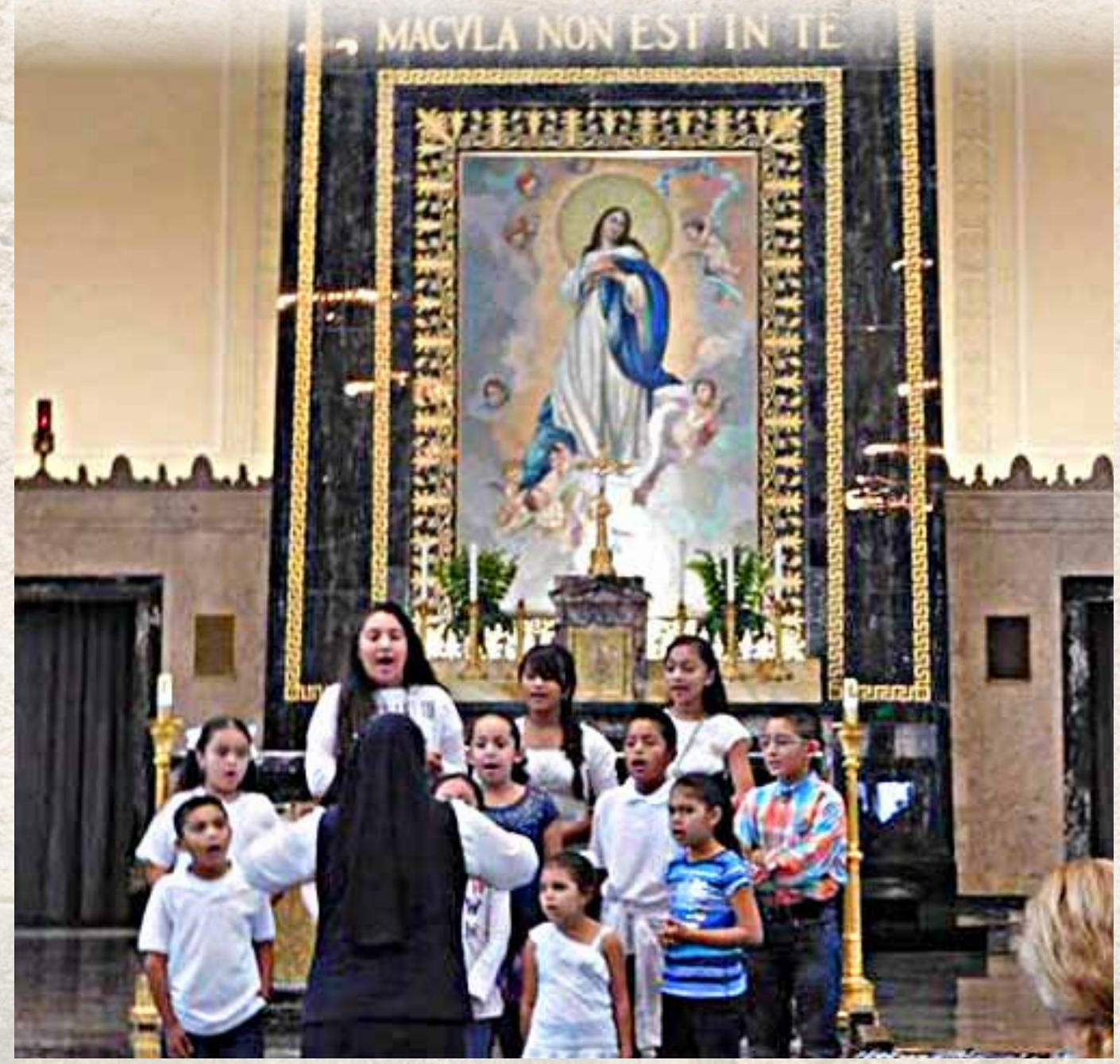
The children's choir from Beardstown performed at the Cathedral for the Immaculate Conception