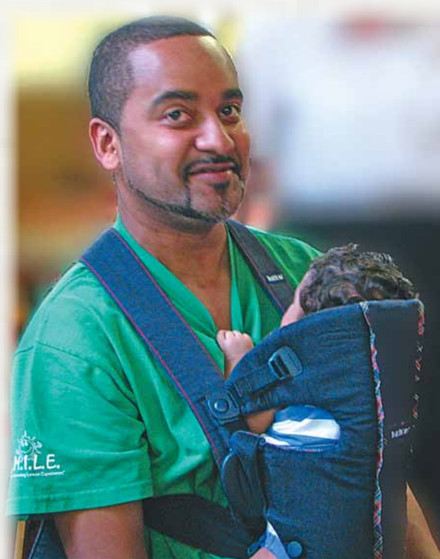
St. Katharine Drexel Springfield

The bylaws of the Foundation require that the president of the Board of Directors appoint an advisory board to offer advice on any matter handled by the Foundation. Each member of the advisory board serves for a three-year term, which is renewable. It is required to meet annually, though in practice it meets more frequently.