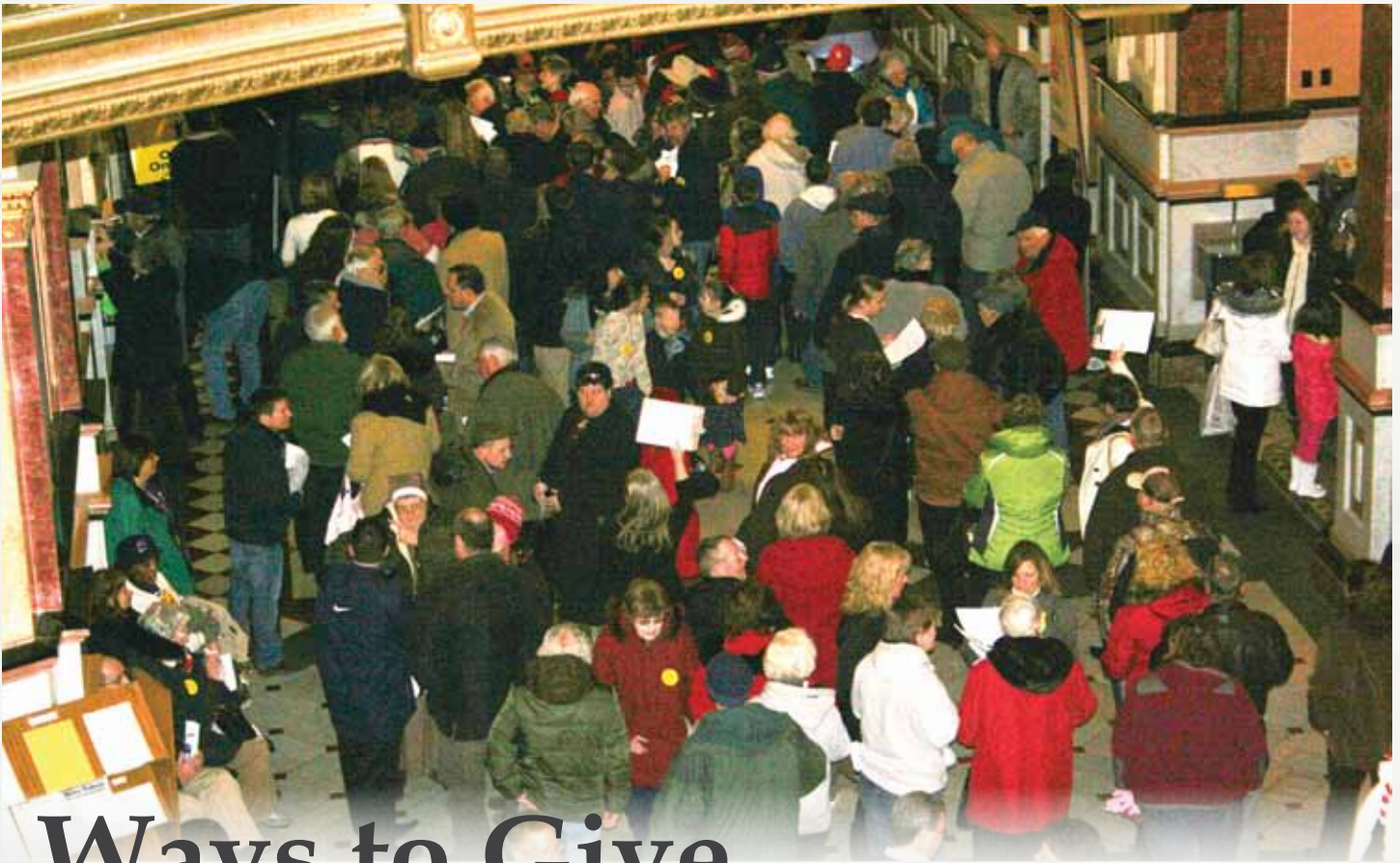
Catholics at the Capitol Catholic Times