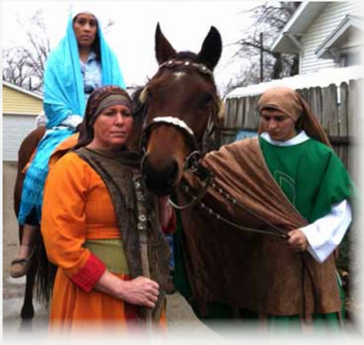
St. Charles Borromeo, Charleston Catholic Times