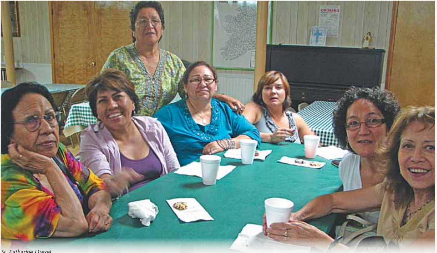
St. Katharine Drexel Springfield